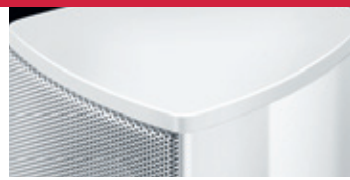
White "high gloss" lacquer White metal lattice