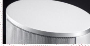
Silver anodized aluminum Silver metal lattice