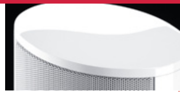
White "high gloss" lacquer White metal lattice

Its sound performance is as mature and powerful as its appearance is slender and elegant. The modified cabinet geometry, new surface finishes and the revised structure of the front covers are the technical secret behind the new speakers of the CD series and the reason for the tonal finesse. You will be persuaded by the more finely tuned speaker technology underneath, based on aluminum membranes.