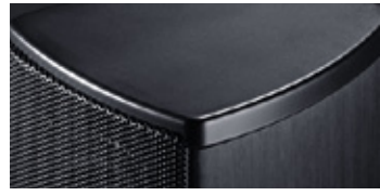
Black anodized aluminum Black metal lattice