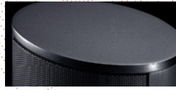
Black anodized aluminum Black metal lattice